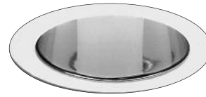
LC122 (shown) Open Trim, Clear Reflector