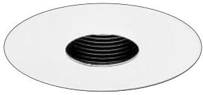
LC101 1-3/4" Pinhole, Black Baffle 4-3/4" O.D. (121 mm)