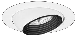
LC108 Adjustable Eyeball, Black Baffle