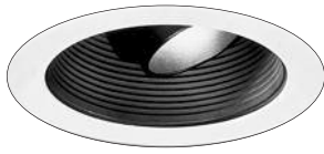
LC141 (shown) Adjustable Gimbal Ring, Black Baffle