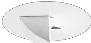
LC105 Adjustable Mirror Light LA105 Spread Reflector included 30°-90° Tilt 4-3/4" O.D. (121 mm)