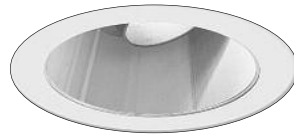
LC142 (shown) Adjustable Gimbal Ring, Clear Reflector