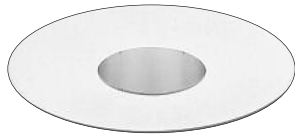
LC103 (shown) 1-3/4" Pinhole, Gold Reflector