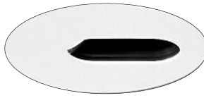
LC119 Recessed Adjustable Slot 30° Tilt 4-3/4" O.D. (121 mm)