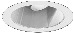
LC142 (shown) Adjustable Gimbal Ring, Clear Reflector