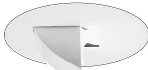
LC105 Adjustable Mirror Light 30°-90° Tilt 4-3/4" O.D. (121 mm)