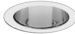
LC122 (shown) Open Trim, Clear Reflector