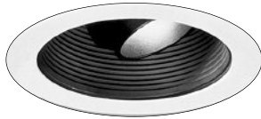
LC141 (shown) Adjustable Gimbal Ring, Black Baffle