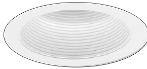
LC121W (shown) Open Trim, White Baffle