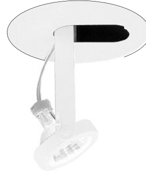
LC190 Drop Adjustable, Gimbal Ring Length 4 1/2" Lamp positioned at 4-1/2" below ceiling