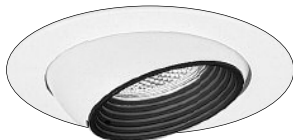
LC108 Adjustable Eyeball, Black Baffle