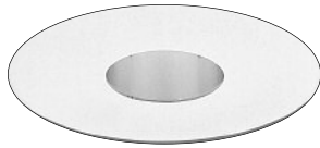
LC103 (shown) 1-3/4" Pinhole, Gold Reflector