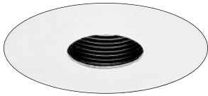
LC101 1-3/4" Pinhole, Black Baffle 4-3/4" O.D. (121 mm)