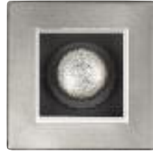
LCI36M1 Adjustable gimbal brushed nickel trim w/white cone 4-5/8" sq. (117 mm) Housing Lamp Wattage CMHR4GX GX10 20W GX10 39W