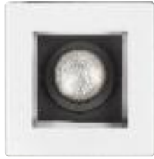
LCI32 Adjustable gimbal white trim w/ clear cone 4-5/8" sq. (117 mm) Housing Lamp Wattage CMHR4GX GX10 20W GX10 39W