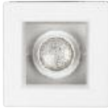
LCI36 Adjustable gimbal white trim w/white cone 4-5/8" sq. (117 mm) Housing Lamp Wattage CMHR4GX GX10 20W GX10 39W