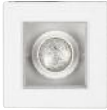
LCI31W Adjustable gimbal white trim w/white baffle 4-5/8" sq. (117 mm) Housing Lamp Wattage CMHR4GX GX10 20W GX10 39W