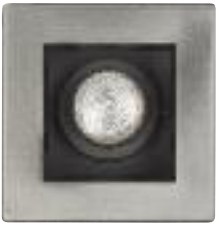
LCI34M1 Adjustable gimbal brushed nickel trim w/black cone 4-5/8" sq. (117 mm) Housing Lamp Wattage CMHR4GX GX10 20W GX10 39W