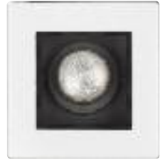
LCI34 Adjustable gimbal white trim w/ black cone 4-5/8" sq. (117 mm) Housing Lamp Wattage CMHR4GX GX10 20W GX10 39W