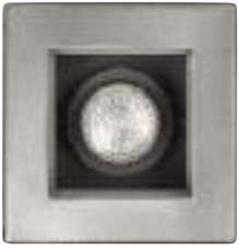
LCI37SL Adjustable gimbal brushed nickel trim w/brushed nickel cone 4-5/8" sq. (117 mm) Housing Lamp Wattage CMHR4GX GX10 20W GX10 39W

Philips Capri reserves the right to make changes without notice.©2009