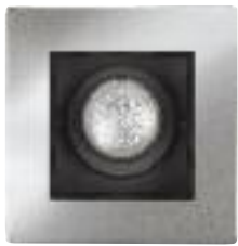
LCI34M2 Adjustable gimbal chrome trim w/black cone 4-5/8" sq. (117 mm) Housing Lamp Wattage CMHR4GX GX10 20W GX10 39W