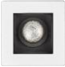
LCI31 Adjustable gimbal white trim w/black baffle 4-5/8" sq. (117 mm) Housing Lamp Wattage CMHR4GX GX10 20W GX10 39W