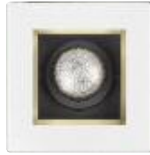
LCI33 Adjustable gimbal white trim w/ gold cone 4-5/8" sq. (117 mm) Housing Lamp Wattage CMHR4GX GX10 20W GX10 39W