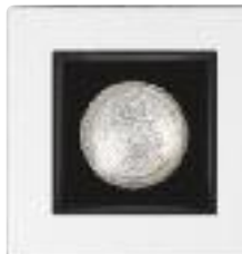
R451 Adjustable white trim w/black baffle 4-5/8" O.D. (117 mm) Housing Lamp Wattage RR4 PAR20 50W PAR16 55W