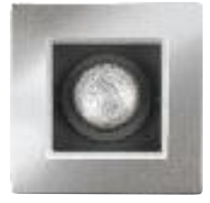
LC136M2 Adjustable gimbal chrome trim w/white cone 4-5/8" sq. (117 mm) Housing Lamp Wattage RR4 PAR16 55W