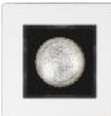
R454 Adjustable white trim w/black cone 4-5/8" sq. (117 mm) Housing Lamp Wattage RR4 PAR20 50W PAR16 55W