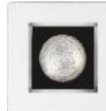
R452 Adjustable white trim w/clear cone 4-5/8" O.D. (117 mm) Housing Lamp Wattage RR4 PAR20 50W PAR16 55W