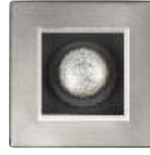
LC136M1 Adjustable gimbal brushed nickel trim w/white cone 4-5/8" sq. (117 mm) Housing Lamp Wattage RR4 PAR16 55W