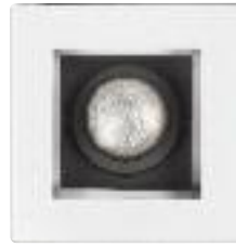
LC132 Adjustable gimbal white trim w/ clear cone 4-5/8" sq. (117 mm) Housing Lamp Wattage RR4 PAR16 55W