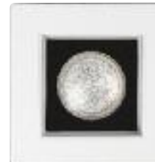
R451W Adjustable white trim w/ white baffle 4-5/8" O.D. (117 mm) Housing Lamp Wattage RR4 PAR20 50W PAR16 55W