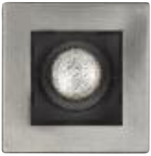
LC134M1 Adjustable gimbal brushed nickel trim w/black cone 4-5/8" sq. (117 mm) Housing Lamp Wattage RR4 PAR16 55W