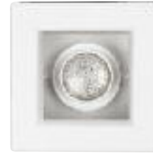
LC136 Adjustable gimbal white trim w/white cone 4-5/8" sq. (117 mm) Housing Lamp Wattage RR4 PAR16 55W