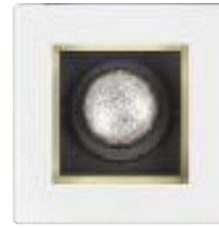
LC133 Adjustable gimbal white trim w/ gold cone 4-5/8" sq. (117 mm) Housing Lamp Wattage RR4 PAR16 55W