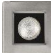
R457SL Adjustable brushed nickel trim w/ brushed nickel cone 4-5/8" sq. (117 mm) Housing Lamp Wattage RR4 PAR20 50W PAR16 55W

Philips Capri reserves the right to make changes without notice.©2009