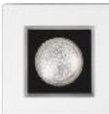
R456 Adjustable white trim w/white cone 4-5/8" sq. (117 mm) Housing Lamp Wattage RR4 PAR20 50W PAR16 55W