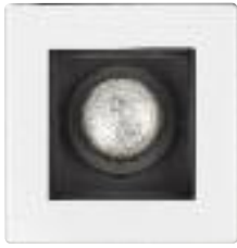
LC131 Adjustable gimbal white trim w/black baffle 4-5/8" sq. (117 mm) Housing Lamp Wattage RR4 PAR16 55W