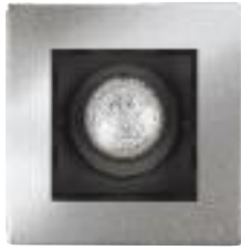
LC134M2 Adjustable gimbal chrome trim w/black cone 4-5/8" sq. (102 mm) Housing Lamp Wattage RR4 PAR16 55W