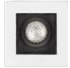
LC134 Adjustable gimbal white trim w/ black cone 4-5/8" sq. (117 mm) Housing Lamp Wattage RR4 PAR16 55W