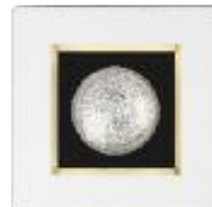
R453 Adjustable white trim w/gold cone 4-5/8" O.D. (117 mm) Housing Lamp Wattage RR4 PAR20 50W PAR16 55W