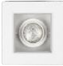
LC131W Adjustable gimbal white trim w/white baffle 4-5/8" sq. (117 mm) Housing Lamp Wattage RR4 PAR16 55W