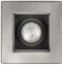
LC137SL Adjustable gimbal brushed nickel trim w/brushed nickel cone 4-5/8" O.D. (117 mm) Housing Lamp Wattage RR4 PAR16 55W